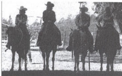
Four of the graduates of the Reis Ranch horsemanship course Saturday watch others demonstrate methods they learned during the program.

STAR POWER: In Penn Grove, singer Jewel among those pushing for equine recognition